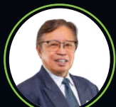
The Right Honourable Datuk Patinggi Tan Sri (Dr) Abang Haji Abdul Rahman Zohari Bin Tun Datuk Abang Haji Openg Premier Of Sarawak